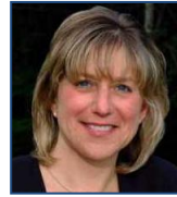
Senator Karen Spilka Job Creation Commission