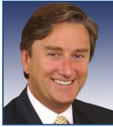
Congressman John F. Tierney US House of Representatives